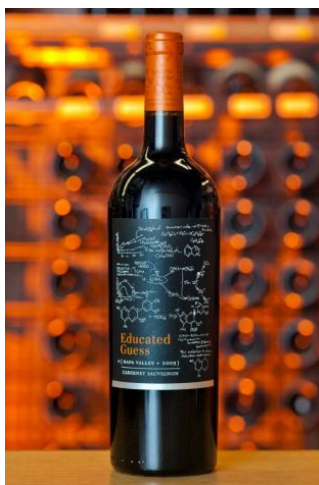
TOP TIER: 2009 Educated Guess Cabernet Sauvignon