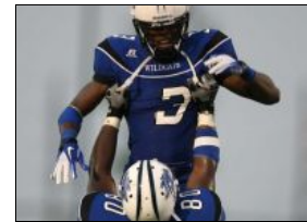
Top 5 high school RBs to watch