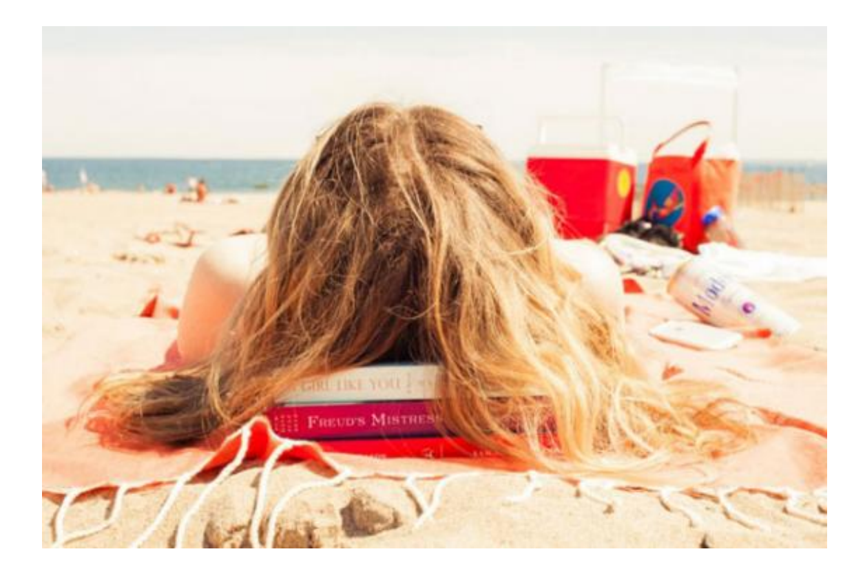
under Culture, Eat + Drink, Wine Country, books, reading, summer wines

notably depicted in the Epic of Gilgamesh. Today, Siduri Wines produces over two dozen pinot noirs from the grape's most important appellations in California and Oregon. With flavors of maraschino cherry, raspberry, cola and Christmas spices, their Russian River Valley pinot is worthy of the goddess herself.